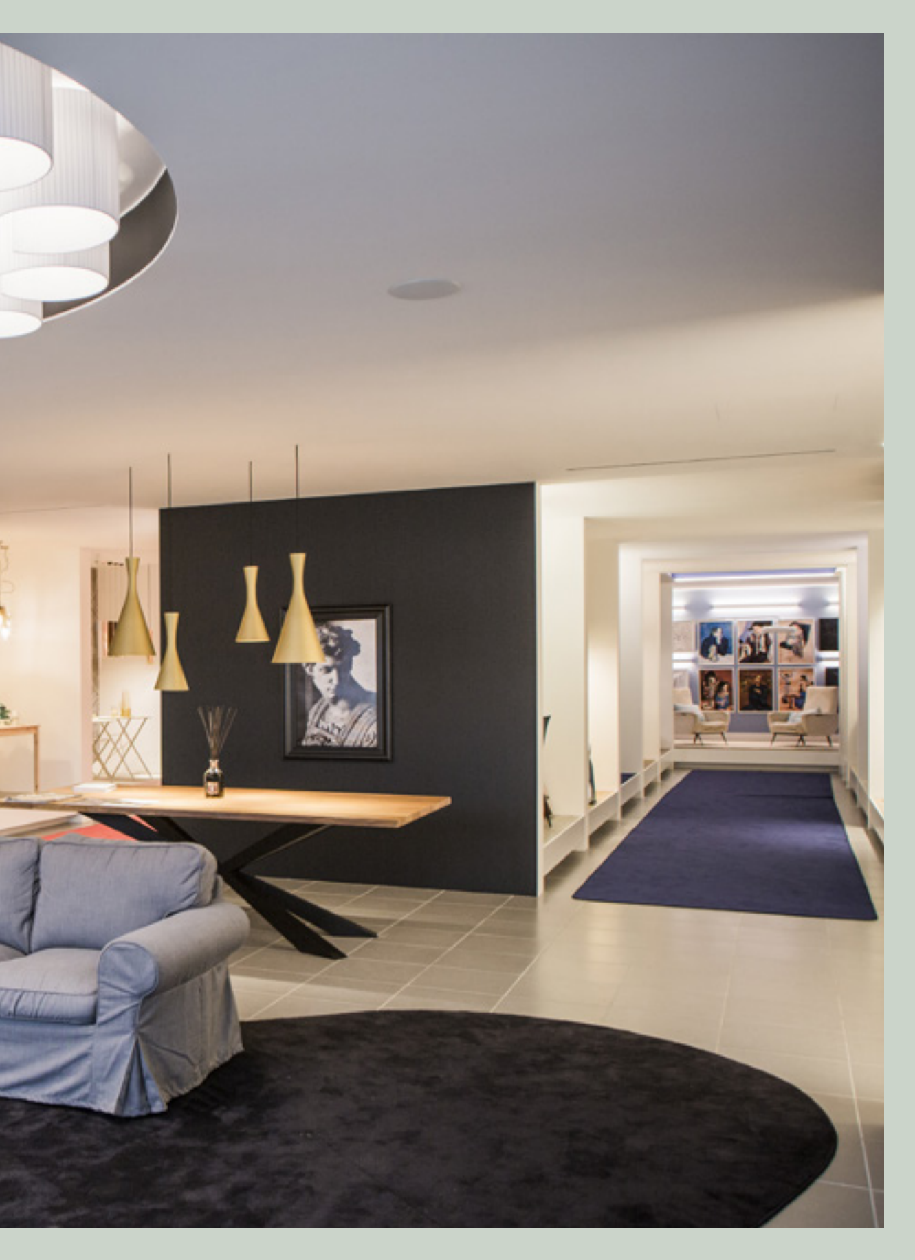
Showroom at OLEV Headquarters in Molvena, ITALY