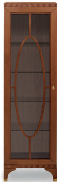
LEFT OPENING GLASS CASE

Finish: MC - Modern cherry - Cat. ZE Standard: Metal tips leg W. 70 D. 42 H. 221