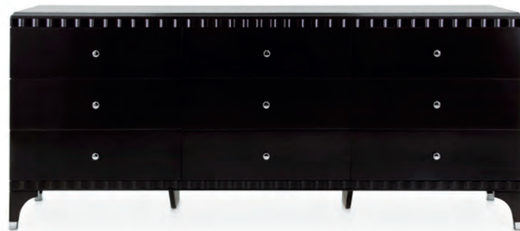
9 DRAWERS SIDEBOARD

Finish: P3 - Moka - cat. ZA W. 152 D. 59 H. 91