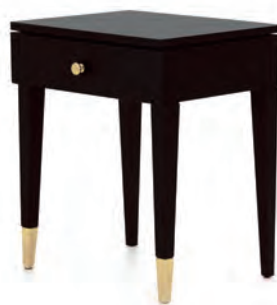
LOOK SINGLE DRAWER NIGHTSTAND

Art. 00TE351 Finish: P3 - Moka - Cat. ZA Upholstery: Fabric LRW - Cat. B Optional: Quilted design on the headboard not included W. 120 D. 9,5 H. 150