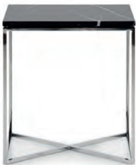
KLEPSIDRA LAMP TABLE

Art. 00TA145M Marble top: Carrara white Metal base: Chrome W. 130 D. 80 H. 40