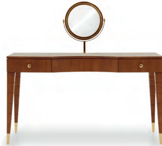
LOOK DRESSING TABLE WITH SWIVEL MIRROR

Finish: MC - Modern cherry - Cat. ZE Metal tips leg: Gold plated W. 140 D. 55 H. 80