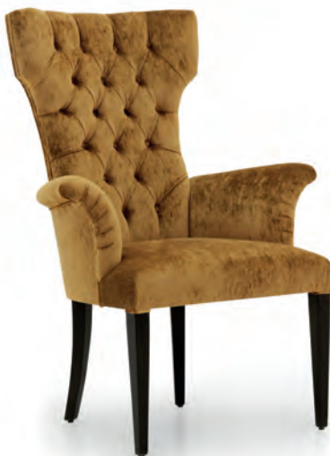
QUEEN SMALL ARMCHAIR

Finish: WE - Wengé - Cat. ZE Upholstery: Fabric DAH - Cat. D Trimmings: F – Shaded nails Standard: Round handle on the back included Optional: Tufted back not included W. 46 D. 56 H. 95