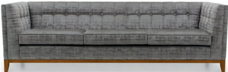
LIXIS 5 SEATER SOFA

Art. 9452O Finish: MC - Modern cherry - Cat. ZE Upholstery: Fabric LJJ - Cat. B Trimmings: Self piping W. 96 D. 81 H. 51