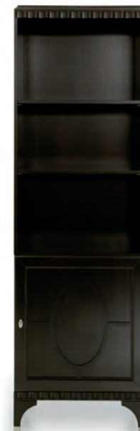
RIGHT OPENING BOOKCASE

Finish: WE - Wengé - Cat. ZE Standard: Metal tips leg W. 70 D. 42 H. 221