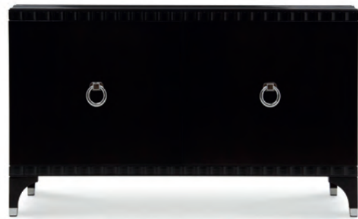
2 DOORS SIDEBOARD