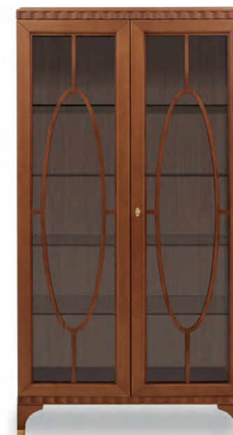
2 DOOR GLASS CASE

Finish: MC - Modern cherry - Cat. ZE W. 220 D. 55 H. 85