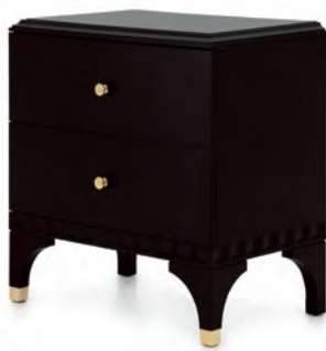
2 DRAWERS NIGHTSTAND

Art. 00LT350 Finishing: P3 - Moka - Cat. ZA Upholstery: Combination H69 - Cat. B Optional: Quilted design on the headboard not included Standard: metal tip legs included Note: Mattress sizes 180 x 200 W. 193 D. 216 H. 145