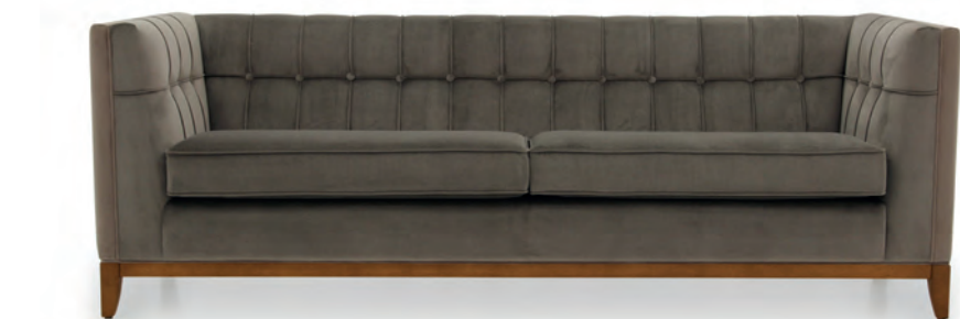
LIXIS 4 SEATER SOFA

Art. 9452F Finish: MC - Modern cherry - Cat. ZE Upholstery: Combination H49 LF6+AD2 - Cat. B Trimmings: Self piping Standard: Buttons on the back included W. 230 D. 84 H. 80