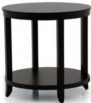
KYLINDO LAMP TABLE

Art. 00TA219 Finish: WE - Wengé - Cat. ZE W. 90 D. 90 H. 45,5