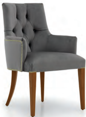
OLIMPIA SMALL ARMCHAIR

Art. 00TA489 Finish: P3 - Moka - cat. ZA Standard: Lazy Susan diam. cm.70 included W. 160 D. 160 H. 84