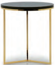
TRIO LAMP TABLE

Art. 00TA142 Marble top: Emperador dark Metal base: Gold plated W. 80 D. 80 H. 41