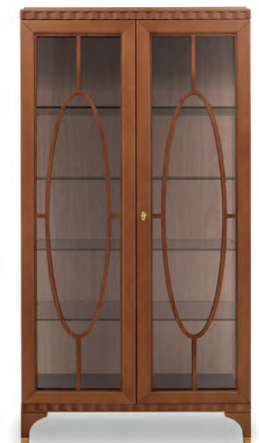
2 DOORS DISPLAY CABINET GLASS SIDE PANELS

Finish: MC - Modern cherry - Cat. ZE Standard: Metal tips leg W. 111 D. 42 H. 221