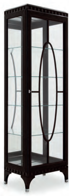
RIGHT OPENING GLASS CUPBOARD

Art. 00VE353 Finish: O6 - English mahogany - cat. ZB Standard: metal tip legs included W. 111 D. 42 H. 221