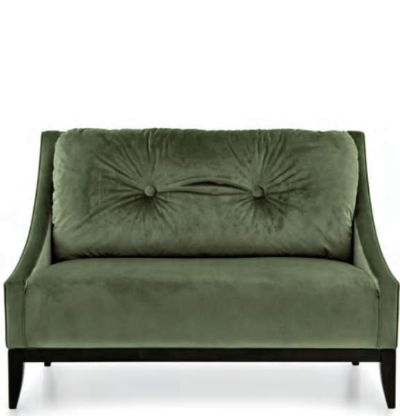
DOROTEA 2 SEATER SOFA

Art. 0595P Finish: P3 - Moka - Cat. ZA Upholstery: Fabric M4Z - Cat. C Trimmings: Self piping Standard: Loose cushion included W. 72 D. 85 H. 89