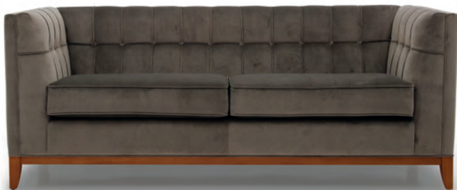
LIXIS 3 SEATER SOFA

Art. 9452P Finish: MC - Modern cherry - Cat. ZE Upholstery: Fabric AD3 - Cat. A Trimmings: Self piping Standard: Buttons on the back included W. 95 D. 80 H. 80