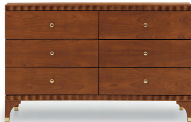
CHEST OF DRAWERS

Finish: MC - Modern cherry - Cat. ZE Metal tips leg: Gold plated W. 140 D. 55 H. 130