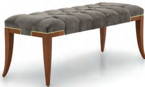
IDRA UPHOLSTERED BENCH

Art. 04550 Upholstery: Fabric LJK - Cat. B W. 51 D. 51 H. 50