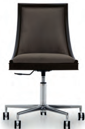
AMINA SWIVEL CHAIR

Finish: WE - Wengé - Cat. ZE Lined inserts: Fabric A8R – Cat. A Metal tips leg: Chrome W. 133,8 D. 72 H. 91,5