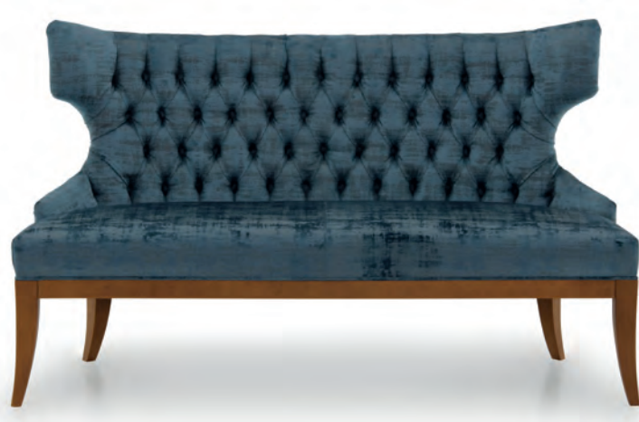
IRENE 2 SEATER SOFA

Art. 0451P Finish: MC - Modern cherry - Cat. ZE Upholstery: Fabric LFS - Cat. B Trimmings: Self piping Standard: Tufted back included W. 77 D. 72 H. 86