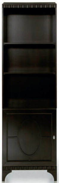
LEFT OPENING BOOKCASE

Finish: MC - Modern cherry - Cat. ZE Standard: Metal tips leg W. 70 D. 42 H. 221