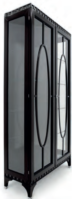
2 DOORS GLASS CUPBOARD

Art. 00VE353 Finish: O6 - English mahogany - cat. ZB Standard: metal tip legs included W. 111 D. 42 H. 221