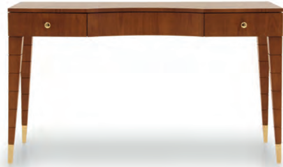
LOOK DRESSING TABLE