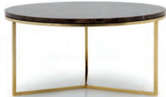
TRIO COFFEE TABLE

Art. 00TA143 Marble top: Emperador light Metal base: Gold plated W. 55 D. 55 H. 60