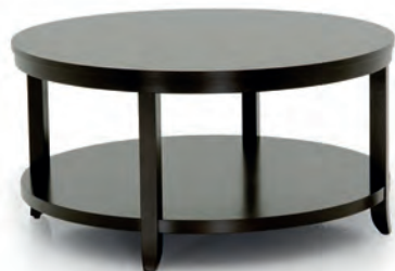
KYLINDO COFFEE TABLE

Art. 00TA219 Finish: WE - Wengé - Cat. ZE W. 90 D. 90 H. 45,5