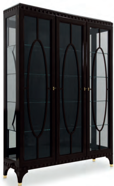
3 DOORS GLASS CUPBOARD

Art. 00VE354 Finish: P3 - Moka - cat. ZA Standard: metal tip legs included Optional: mirror back not included W. 70 D. 48 H. 221