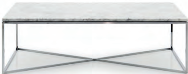
KLEPSIDRA COFFEE TABLE

Art. 00TA119 Finish: P3 - Moka - Cat. ZA W. 61 D. 61 H. 61,5