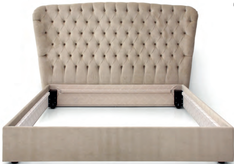
FOLD DOUBLE BED

Art. 00LT05 Upholstery: Fabric LFQ - Cat. B Standard: Tufting included Note: Mattress sizes 180 x 200 W. 228 D. 219 H. 150