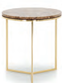
TRIO LAMP TABLE

Art. 9472F Finish: P3 - Moka - cat. ZA Upholstery: Fabric ANS – Cat. A Trimming: Self piping Standard: Buttons on the back included W. 230 D. 82 H. 80 SH. 51 AH. 80