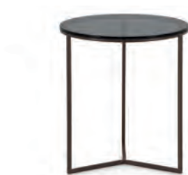
TRIO LAMP TABLE

Art. 9452F Finish: MC - Modern cherry - Cat. ZE Upholstery: Combination H49 LF6+AD2 - Cat. B Trimmings: Self piping Standard: Buttons on the back included W. 230 D. 84 H. 80