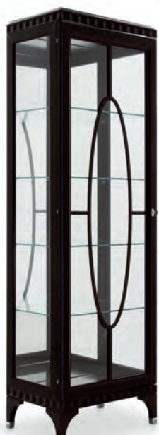
LEFT OPENING GLASS CUPBOARD

Art. 00VE355 Finish: P3 - Moka - cat. ZA Standard: metal tip legs included Optional: mirror back not included W. 167 D. 42 H. 221