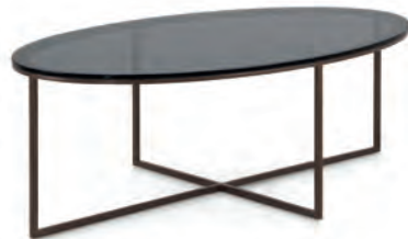
TRIO COFFEE TABLE

Art. 0613F Upholstery: Fabric MA2 – Cat. C Standard: Loose cushions #CUS59 included W. 230 D. 100 H. 84