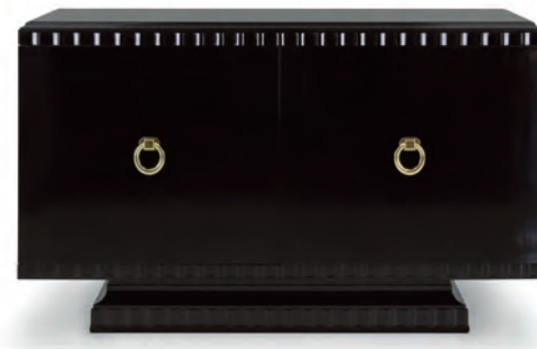
2 DOORS SIDEBOARD

Finish: O6 - English mahogany - cat. ZB Standard: metal tip legs included W. 152 D. 59 H. 91