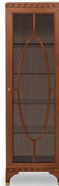
RIGHT OPENING GLASS CASE

Finish: MC - Modern cherry - Cat. ZE Standard: Metal tips leg W. 70 D. 42 H. 221