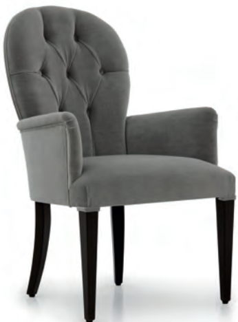
CALIPSO SMALL ARMCHAIR

Art. 0414A Finish: N1 - Satin black - Cat. ZC Upholstery: Fabric DAK - Cat. D Trimmings: H – Double welt Optional: Tufted back not included W. 63 D. 70 H. 102