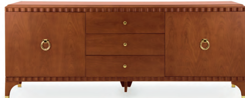
2 DOORS SIDEBOARD WITH DRAWERS

Finish: O6 - English mahogany - cat. ZB Standard: metal tip legs included W. 228 D. 53 H. 96