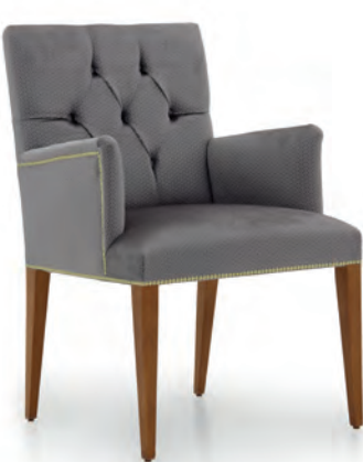
ARIANNA SMALL ARMCHAIR

Finish: MC - Modern cherry - Cat. ZE Upholstery: Fabric LJL - Cat. B Trimmings: D – Brassplated nails Standard: Round handle on the back included Optional: Tufted back not included W. 63 D. 62,5 H. 95